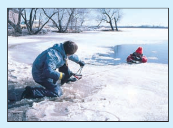
Many items found on shore or in your car, such as jumper cables, a garden hose, some branches, or skis, can be thrown or extended to the victim.

run up to the edge of the hole. This would most likely result in two victims in the water. Also, do not risk your life to attempt to save a pet or other animal.