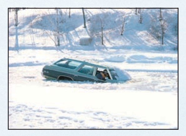
An insurance company staged this breakthrough for a water safety film. The car sank within 45 seconds, turned over, and settled on its top.

hen is ice safe? There really is no sure answer. In fact, ice is probably never 100 percent safe. You can't judge the strength of ice just by its appearance, age, thickness, temperature or whether or not the ice is covered with snow. Strength is based on all these factors -- plus the depth of water under the ice, size of the water body, water chemistry and currents, the distribution of the load on the ice, and local climatic conditions.